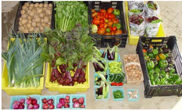
A typical fall 2008 share included Potatoes, Celery, Tomatoes, Chard, Leeks, Beets, Japanese Eggplant, Hot Peppers, Shallots, Garlic, Sweet Peppers & Red Onions